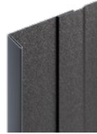
I/S Corner - Starter (10 Ft) #908 (800057)