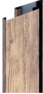
RP6 - 5 1/2" FACE 10' LENGTH - #800014 13' LENGTH - #800016