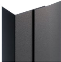
O/S Corner - Starter (13 Ft) #906 (800065)