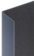
I/S L Trim - Non Hem (10 Ft) #912 (800064)