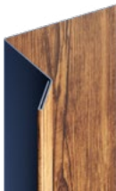
Drip Base (10 Ft) #925 (800080)