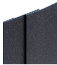
Standard Starter (13 Ft) #914 (800063)