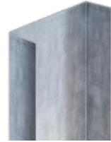
U Support Channel (10 Ft) #800058