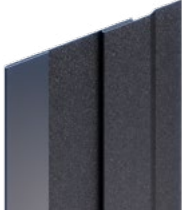
1" Face Joiner Strip (10 Ft) #800002