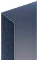
O/S L Trim - Non Hem (10 Ft) #910 (800062)