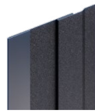
1" Face Joiner Strip (13 Ft) (800004)