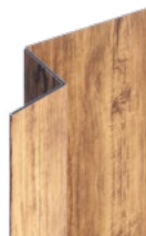
RP Dripcap (10 Ft) #927 (800084)