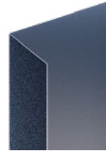
O/S L Trim - Non Hem (13 Ft) #910 (800072)