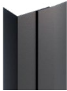
O/S Corner - Starter (10 Ft) #906 (800056)