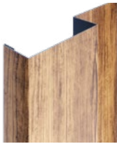
Box Base Trim (10 Ft) #904 (800054)