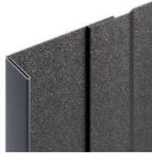
I/S Corner - Starter (13 Ft) #908 (800061)