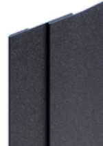
Standard Starter (10 Ft) #914 (800060)