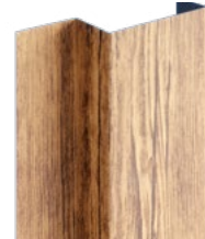
Z Support Trim (10 Ft) #920 (800066)