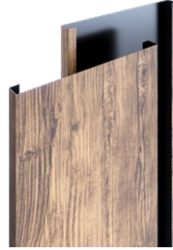
RP10 - 9 1/2" FACE 10' LENGTH - #800022 13' LENGTH - #800024